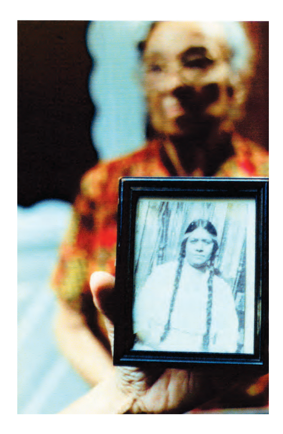
Phoebe Farris, Before Assimilation , 2000. Color Photo.