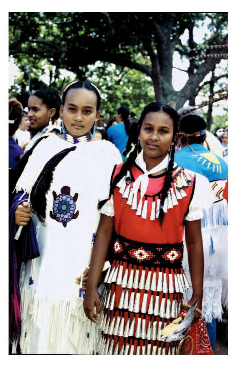
ABOVE Phoebe Farris, The Hunter Sisters-Shinnecock Reservation , New York, 1994. Color photo.