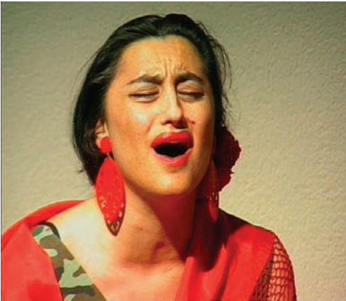
Figure 7, left Singing Prohibited (Prohibido el canto) , 2000 Pilar Albarracín (Spain) Video, color, sound, 6 min. 20 sec.