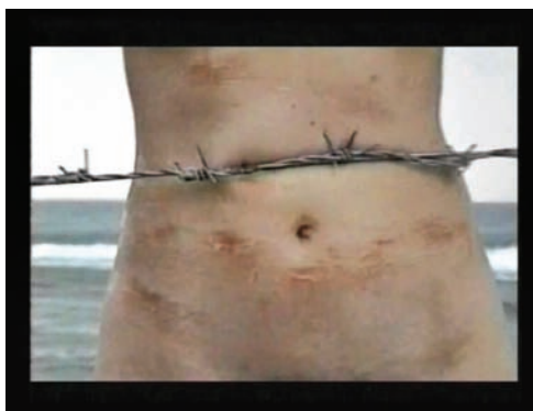
Figure 4, above Barbed Hula , 2000 Sigalit Landau (Israel) Single-channel DVD, loop, color, 1 min. 52 sec.