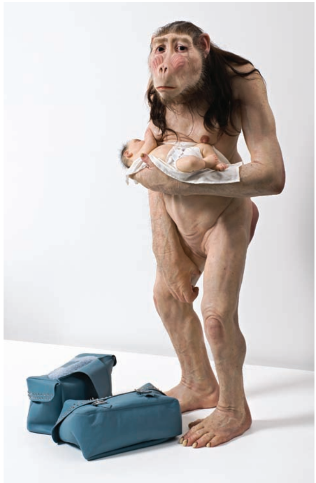
Figure 3, right Big Mother , 2005 Patricia Piccinini (Australia) Silicone, fiberglass, leather, human hair edition of 3, 175 cm. high