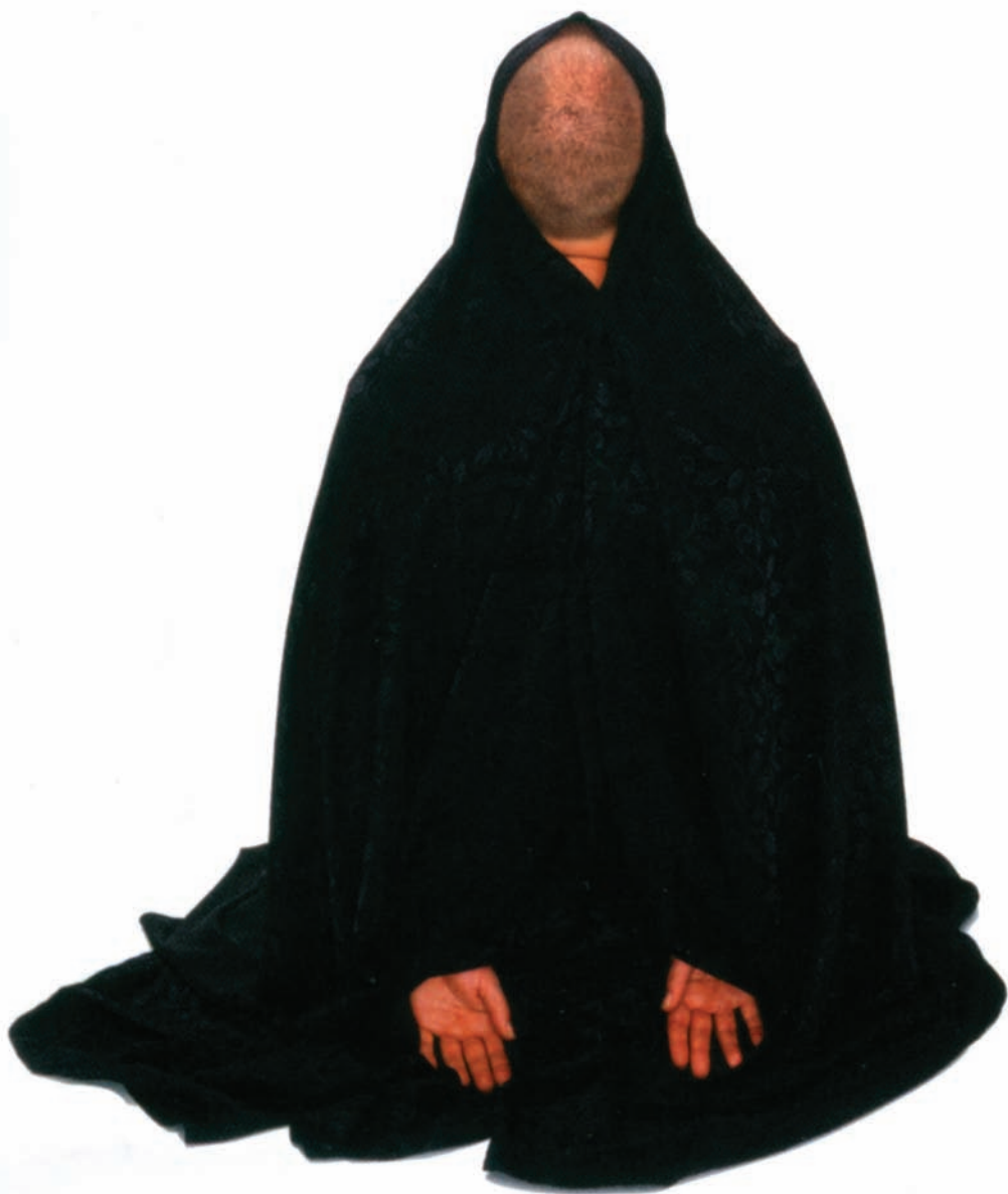
Figure 9 Detail from Blind Spot series, 2001. Parastou Forouhar (Iran)