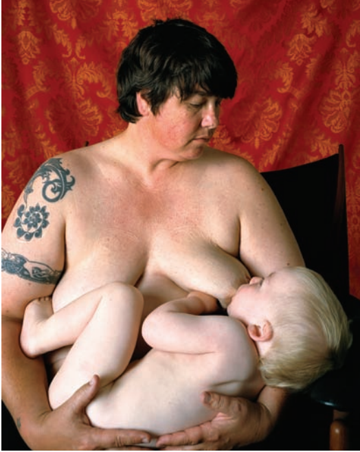
Figure 2, left Self-Portrait/Nursing , 2004 Catherine Opie (United States) Chromogenic print, edition of 8, 40 x 32 inches