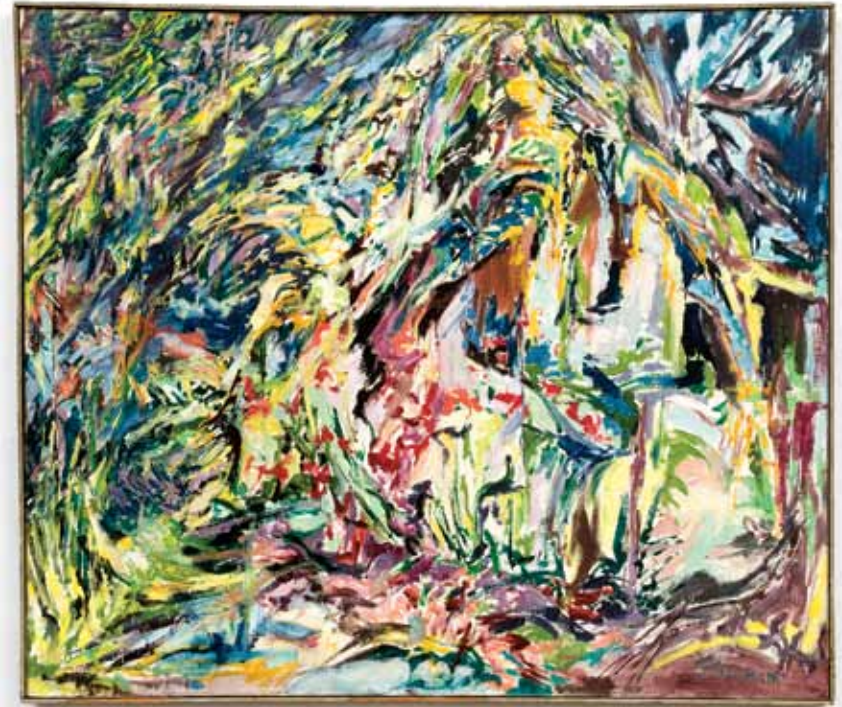
Summer I (Honey Suckle) (1959) Oil on canvas; 42 × 49 inches.