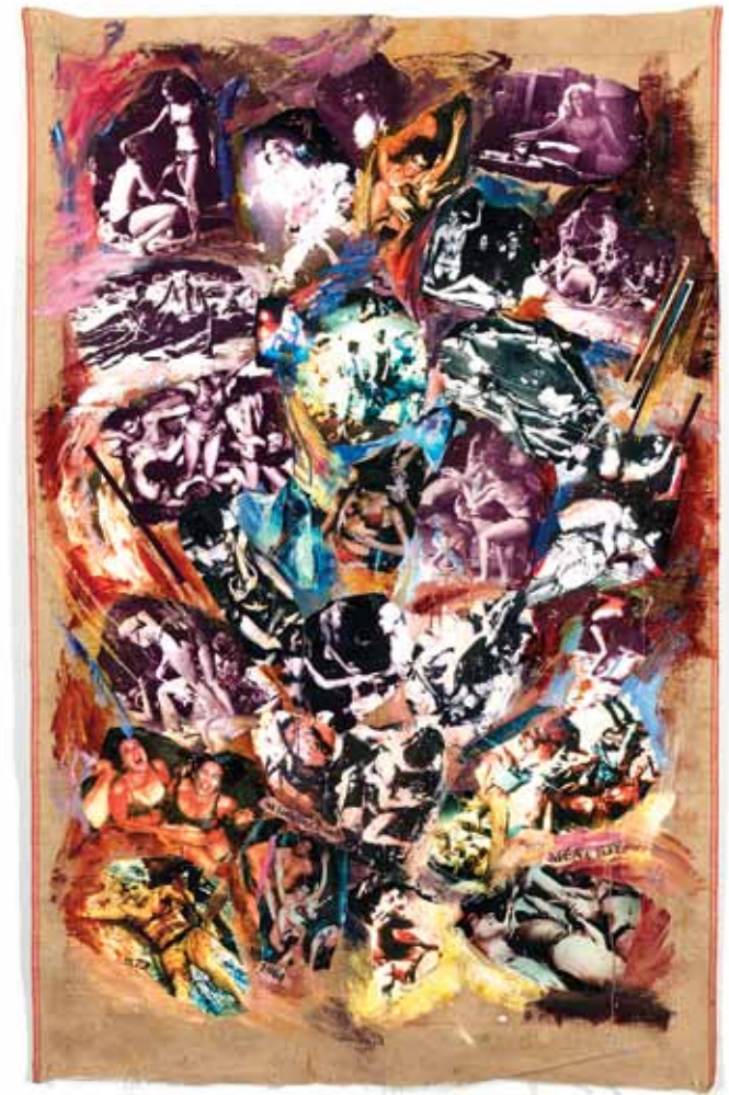
"Meat Joy" (1999; images 1964) Performance collage: photos from 1964 performance, crayon, paint on linen; 83 × 53 inches.