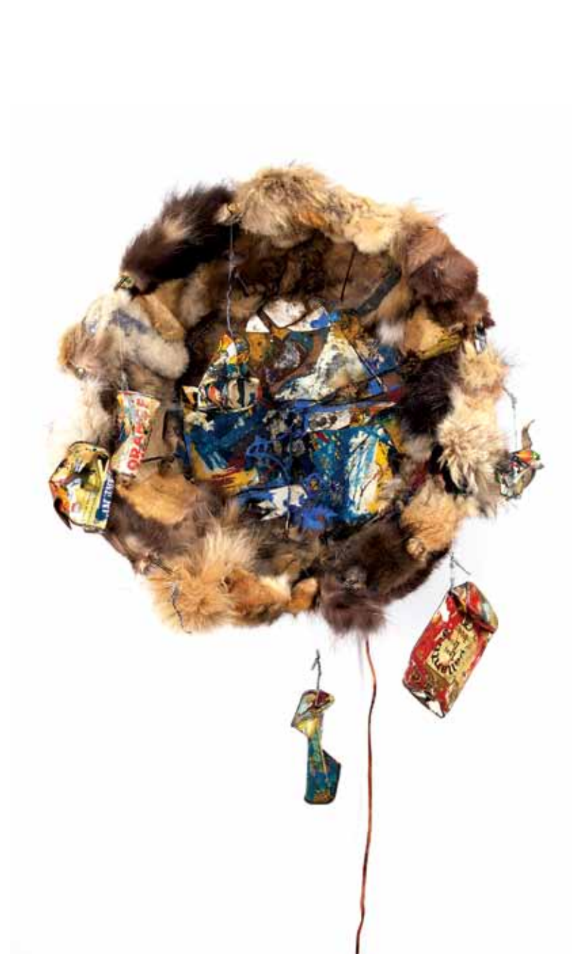
Fur Wheel (1962)

Motorized construction: lamp shade base, fur, tins cans, mirrors, glass, oil paint, mounted on turning wheel; 14 × 14 × 26 inches.