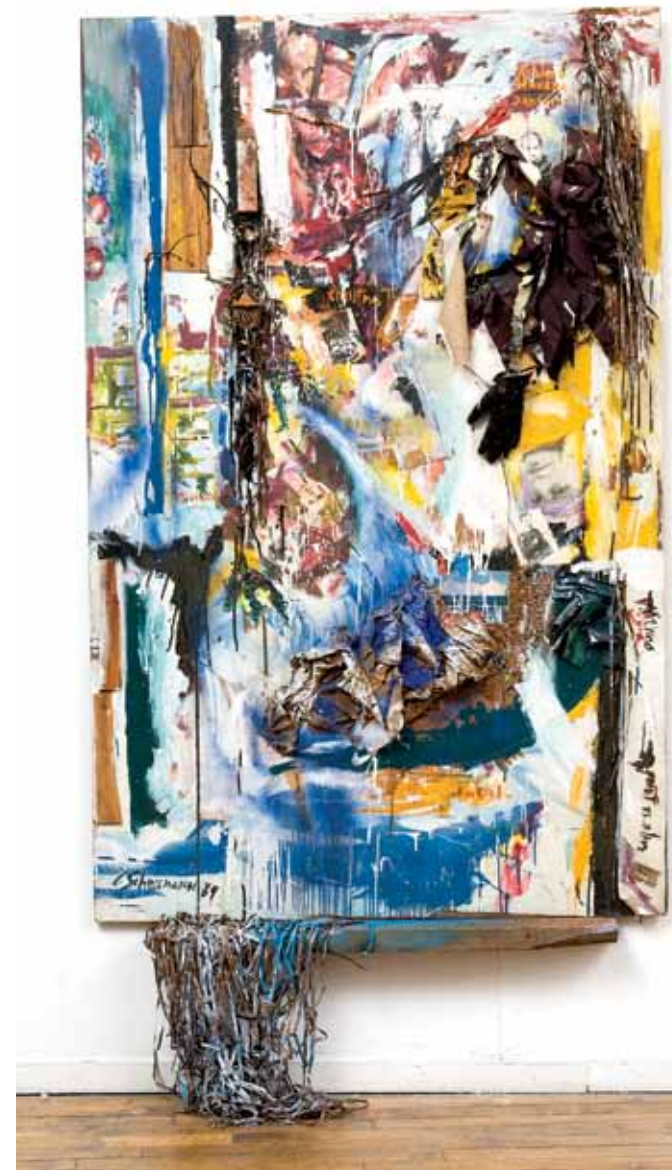
One Window Is Clear - Notes to Lou Andreas Salomé (1965) Painting construction: Masonite, photo reproductions of Salomé, Rilke, Nietzsche, cloth, recording tape, paper, gloves, canvas, oil paint; 77.5 × 48 × 3.5 inches.